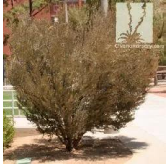
Leather Leaf Acacia ( Acacia Craspedocarpa )