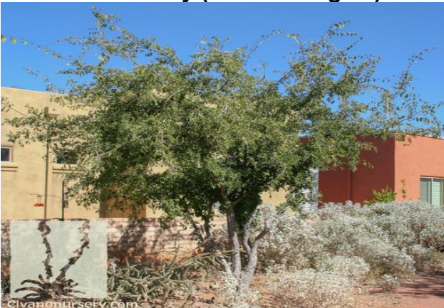
Netleaf Hackberry ( Celtis laevigata )