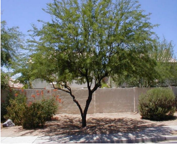
Thornless Mesquite ( Prosopis chilensis )