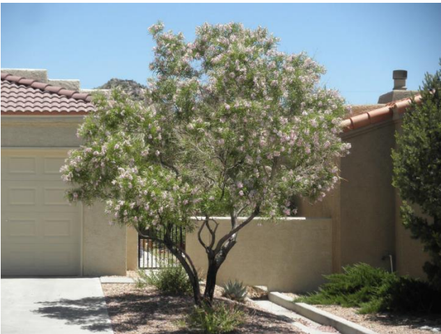
Desert Willow ( Chilopsis linearis )