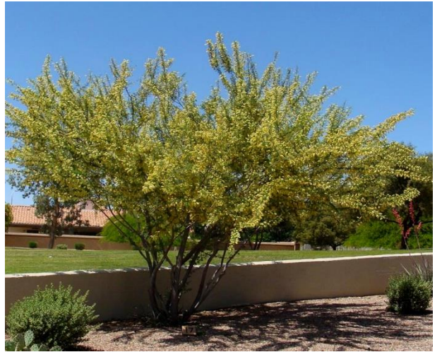
Catclaw acacia ( Acacia Gregii )