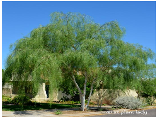
Palo Blanco Acacia ( Acacia willardiana )