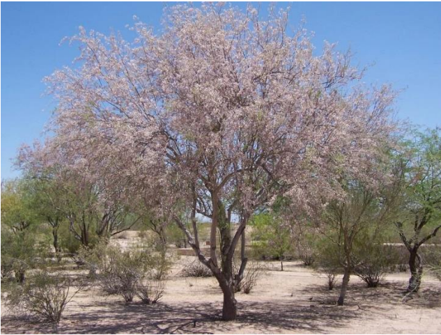
Desert Ironwood ( Olneya tesota )